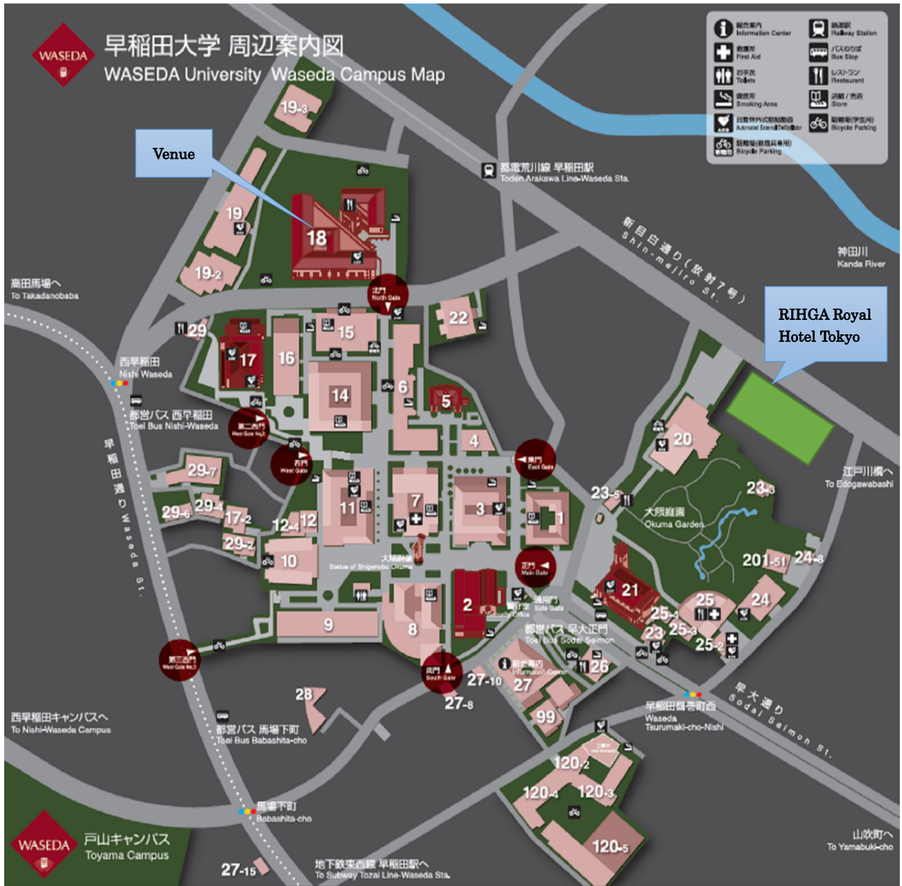
International Conference Center indicated by 18 in the campus map of Waseda University